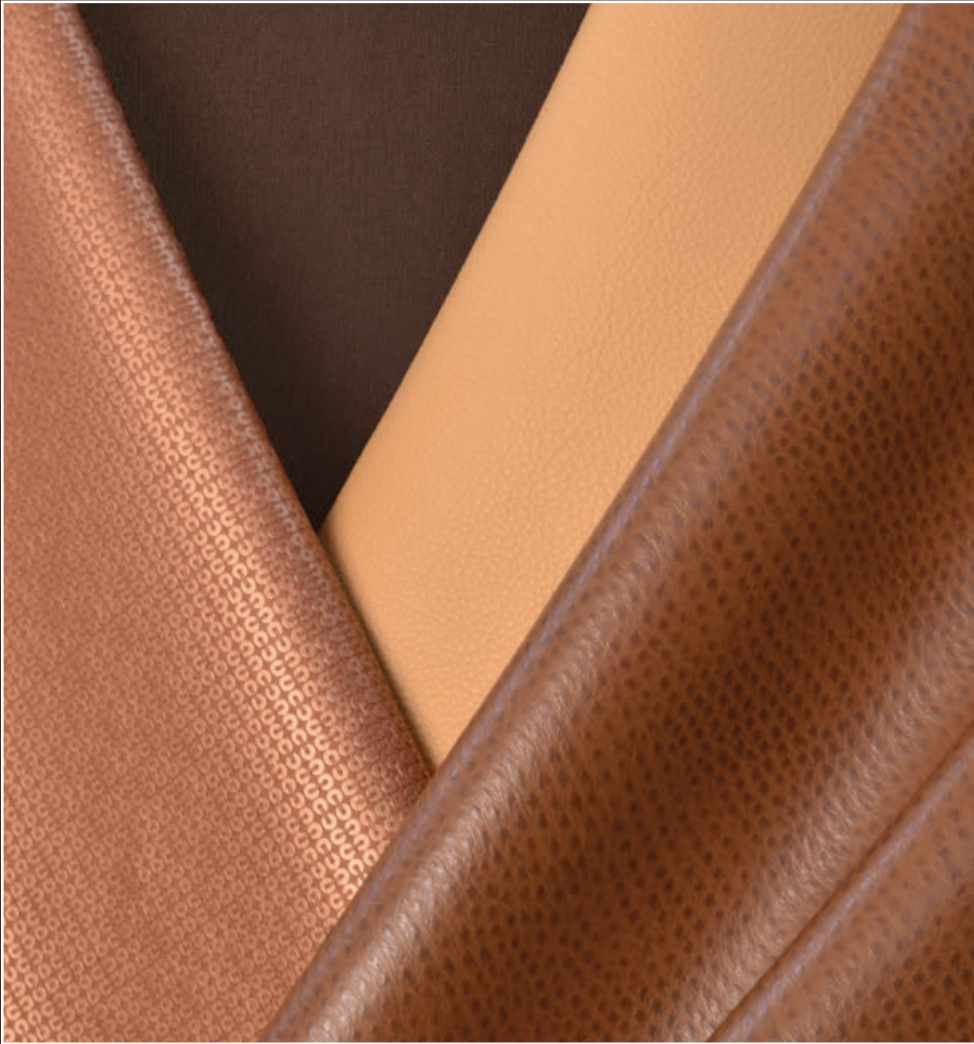
Left to Right: Opera Penny, Acclaim Sable, Barcelona Sisal, and Tundra Nutmeg